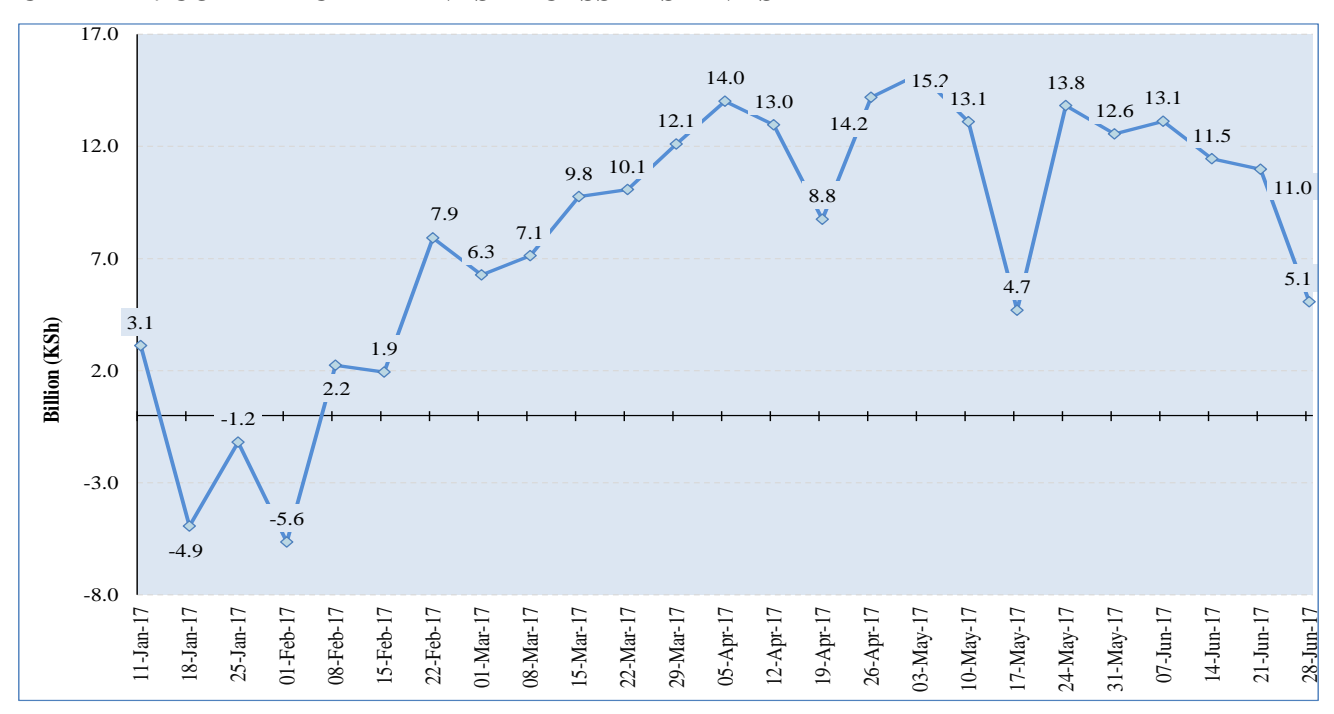
CHART A: COMMERCIAL BANKS EXCESS RESERVES